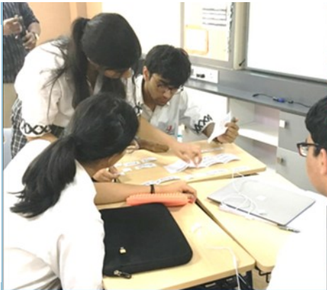
Callido workshop on 2 nd and 3 rd August – focus on skill development among the students